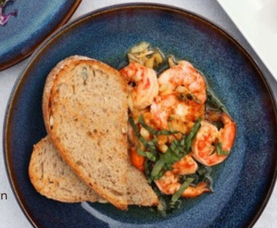
Spanish Garlic Prawn