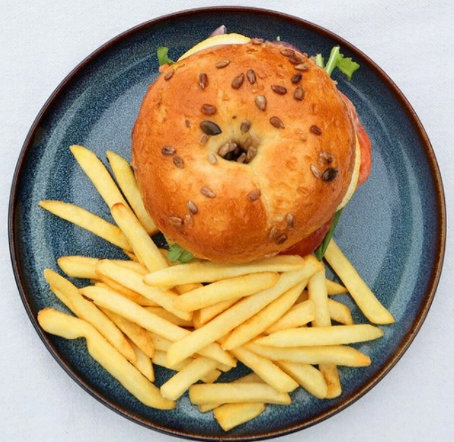
Smoked Salmon Bagel