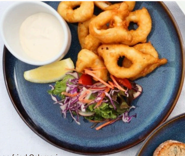
Deep fried Calamari